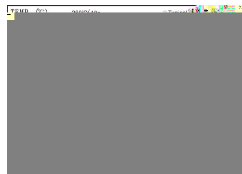
Wave Soldering (Flow Soldering)